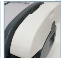
Largest water bottle capacity in the industry 2L capacity eliminate the need for frequent refilling.