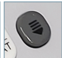
Random Key Length To allow tape to be dispensed in any length with increment of 1cm without limit.