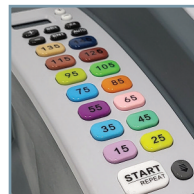
Automatic Function Allows the operator to specify tape length and will automatically dispense them to dramatically increase productivity.