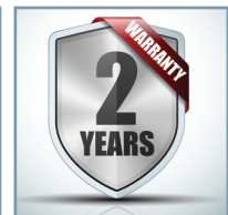
Extended warranty comes with 2-year parts warranty and 1 year labour cover