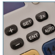
Programmable Keys Can be configured to dispense up to 6 different tape lengths in a sequence allowing maximum flexibility.