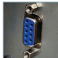
Built-in 9 pin VGA connector Allowing Hexadecimal tape length input from any devices for ultimate carton sealing solution