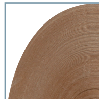
Largest tape capacity in the industry Eliminates the need for frequent roll changes.