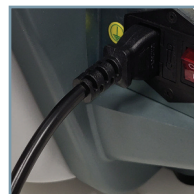
Extra long detachable cord For improved operator ease, comfort and safety.