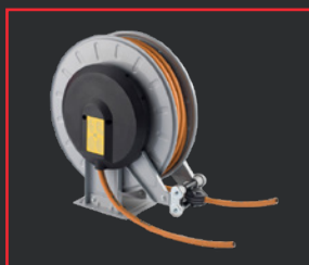
GAS HOSE REEL